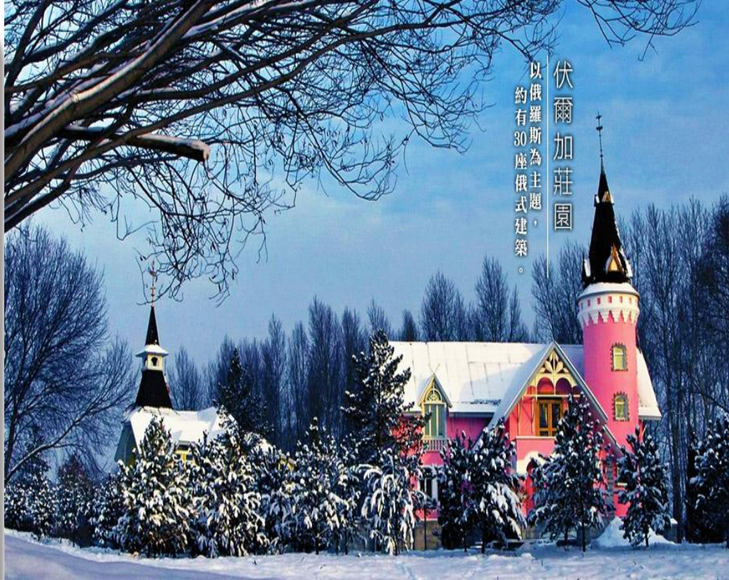
伏爾加莊園 以俄羅斯為主題， 約有30座俄式建築。

Dream Home @ Snow Village + Horse-drawn Sleigh Ride + Yabuli Panda House+ Russian Dance Performance + Modern Ice Lolly = RMB600/Pax (Child height below 1.1M: RMB450/Pax)