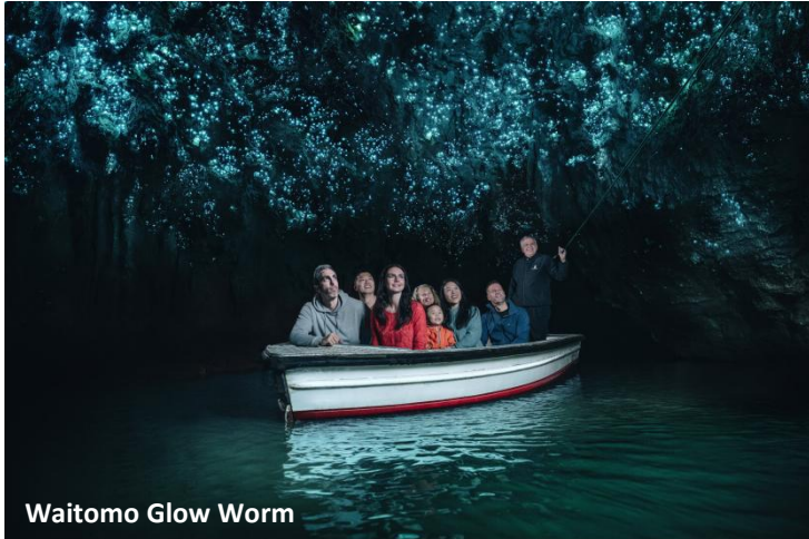
Waitomo Glow Worm

Step into the enchanting village of THE HOBBITON MOVIE SET TOUR . MataMata is a must see! Take a guided tour of the Hobbiton Movie Set™ and you can explore the lush pastures of the Shire as featured in The Lord of the Rings and The Hobbit Trilogies. It has more than 44 unique hobbit holes, including Bag End (Bilbo's house). As you wander through the heart of the Shire, you'll get to hear the fascinating commentary about how it was all created. A quick Auckland city sightseeing to Harbour Bridge , Queen Street , photostop with Auckland Sky Tower .