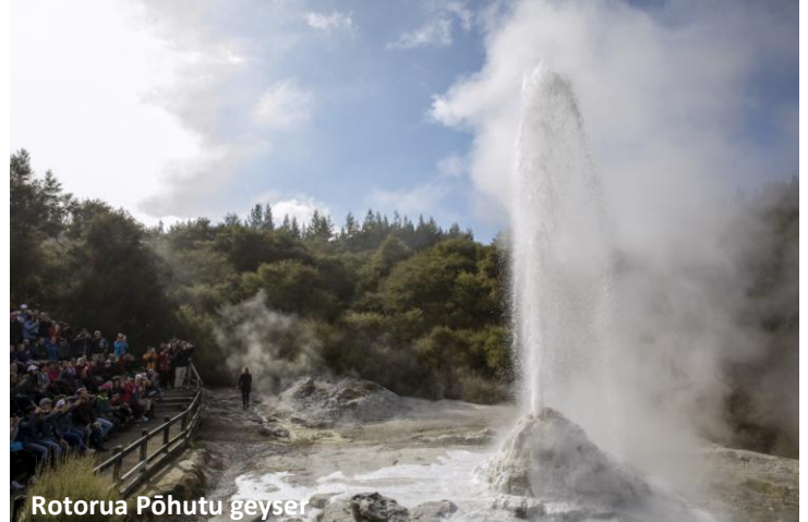
Rotorua Pōhutu geyser

The drive from Lake Tekapo to Queenstown is one of the most beautiful road trips in New Zealand. A quick stop at Pukaki Lookout Point for a panoramic view of Mt Cook . Stop at High Country Alpine Salmon Farm for salmon tasting (at own expenses). Next to Cromwell , Mrs Jones Fruits Stall , one of the best-known fruit stalls in Central Otago, stocks a huge array of fresh fruits, dried fruits, nuts, honey products etc. Enjoy the stunning views as you ride the Skyline Gondola cable car high above Queenstown and Lake Wakatipu to the top of Bob's Peak . The best views in the region spread out in a spectacular 220-degree panorama with breath taking views of Coronet Peak , The Remarkables mountain range and across Lake Wakatipu to Cecil and Walter Peak .