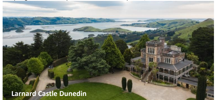
Larnard Castle Dunedin

After breakfast, start our journey to Dunedin. Visit the University of Otago , St. Paul's Cathedral , The Octagon and the magnificent railway Station . Later, enjoy the tour in the Penguin Place Conservation Reserve , learn the natural habitat of the local Yellow Eyed Penguins , and a short bus ride takes you to the reserve where you will continue on foot to see the penguins includes plentiful native bird species, New Zealand fur seals.