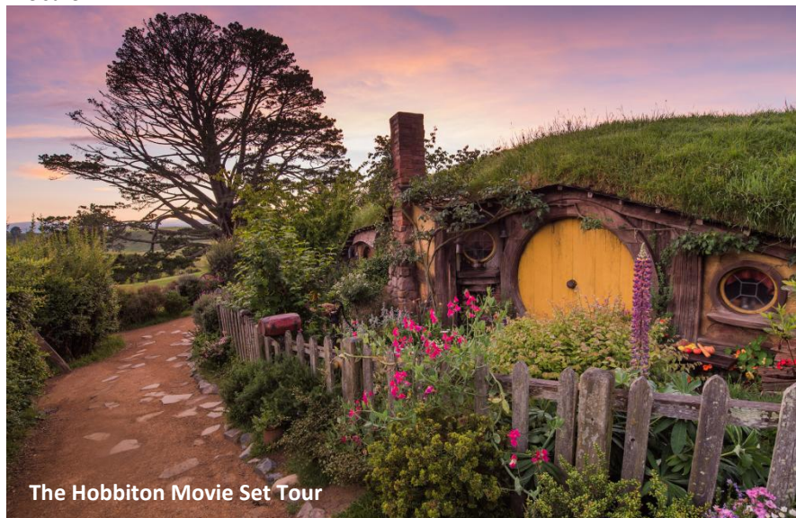
The Hobbiton Movie Set Tour

Head to Te Puia . Discover one of New Zealand's most magnificent geothermal wonderlands – featuring dramatic geysers, bubbling mud, and beautiful native, you will enjoy Maori cultural performances & explore the magic hidden within Te Whakarewarewa Thermal Valley , the home to the Pōhutu geyser – the largest geyser in the Southern Hemisphere! Learn about Maori Culture at Maori Arts & Crafts Centre . Next, bring you to the spectacular Skyline Gondola to enjoy a buffet lunch at the Skyline Stratosfare Restaurant which offers superb views over the city, lake and mountains. In this afternoon, continue experience a Rotorua sightseeing on your own leisure.