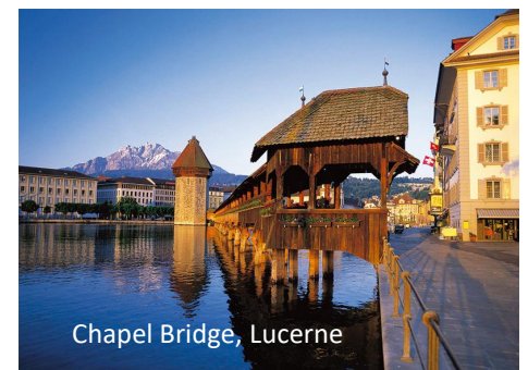
Chapel Bridge, Lucerne

Swiss Guards of Louis XVI during the French Revolution. Next, visit the renovated 14 th Century covered wooden Chapel Bridge which depicts the local history. Then to the Old Town where you will have the chance to visit and buy from Bucherer - Switzerland's biggest and most reputable watch company.