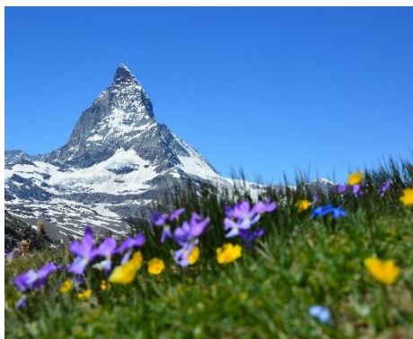
Matterhorn -Inspiration of Toblerone Logo

This morning, we shall drive to Lucerne. An orientation tour here includes a photo stop at the Lion Monument – a masterful stone sculpture in honour of the heroic Swiss Guards of Louis XVI during the French Revolution. Next, visit the renovated 14 th Century covered wooden Chapel Bridge which depicts the local history. Then to the Old Town where you will have the chance to visit and buy from Bucherer - Switzerland's biggest and most reputable watch company.