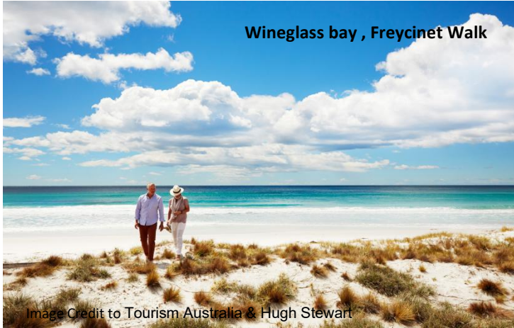
Wineglass bay , Freycinet Walk