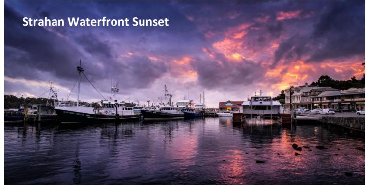
Strahan Waterfront Sunset

Continue through the rainforest to the coastal town of Strahan . Nestled on the shores of Macquarie Harbour, a waterway six times the size of Sydney Harbour, picturesque seaside village of Strahan is the gateway to the World Heritage listed Franklin-Gordon Wild Rivers National Park.