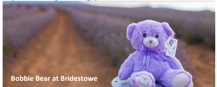
Bobbie Bear at Bridestowe

** For 8Days departures , group depart to Hobart airport on day 8 for the flight to Singapore