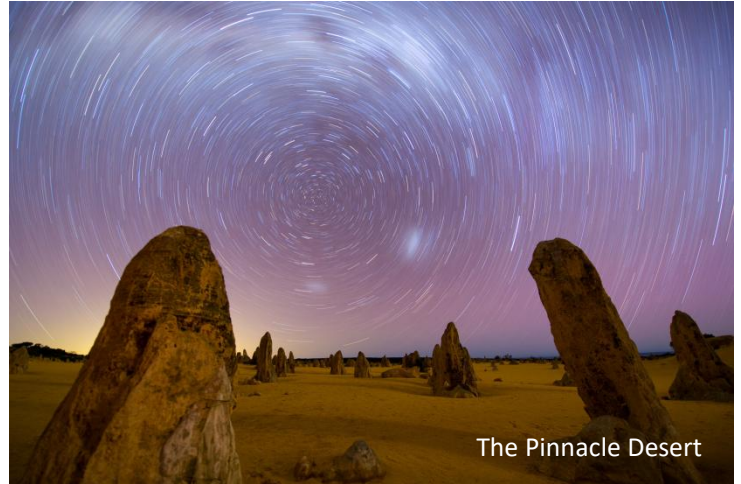
The Pinnacle Desert

After breakfast, spend the day at leisure . Enjoy all that Perth has to offer at your own pace. You may like to join an optional Rottneest Island Tour to meet Quokka. Explore the stunning beauty of this A-Class reserve in air-conditioned comfort, taking in the amazing fauna and flora of the island, stunning beaches, woodlands and incredible salt lakes. This island tour includes all of Rottneest's must-see locations, including Wadjemup Lighthouse, Henrietta Rocks, the majestic look-out point at the rugged Cathedral Rocks and Cape Vlamingh . All major habitats are covered on this amazing tour, including Rottneest's cultural and historical heritage ranging from maritime, colonial and military history to future developments.