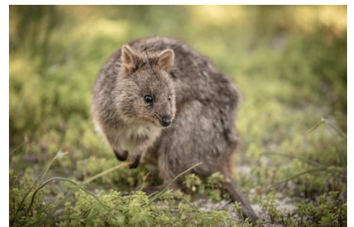
Quokka at Rottneest Island

This morning, after breakfast, if time permits, you can do some last-minute shopping before your transfer to the airport for your flight home.