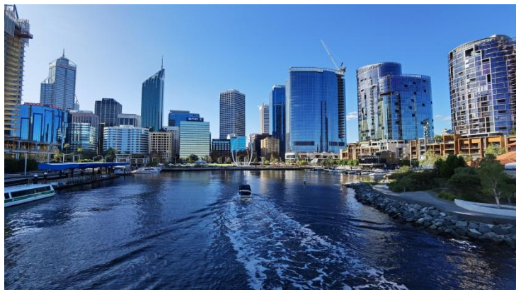
Perth City View

Begin your day with a Perth city tour to experience the blend of modern and historical architecture that gives this place its unique identity. Drive pass Parliament House, St George Terrace, Barrack Arch, Northbridge, Hay Street . Then, have a stopover for photos at Perth Blue Boat House, Kings Park and Botanic Garden for panoramic views of the city. Thereafter, head to Swan Valley to visit Caversham Wildlife Park , largest private collection of native wildlife in Western Australia. Hand-feed the kangaroos, join in the interactive farm show, touch a possum or lizard, meet a wombat, watch the cheeky penguins being fed, and have photos taken with koalas! Next, Visit House of Honey , sanctuary for local bees and hives. To taste raw pure honey and see their live bees display, then indulge yourself in the Western Australia oldest Whistler's Chocolate Company for their traditional chocolates and confectionery. You will have the opportunity to sample and purchase artisan chocolates.