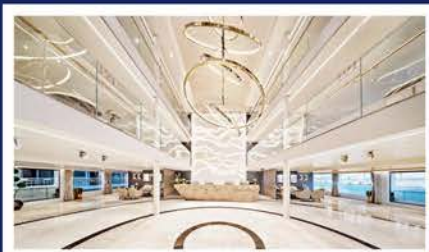
A LUXURIOUS WELCOME