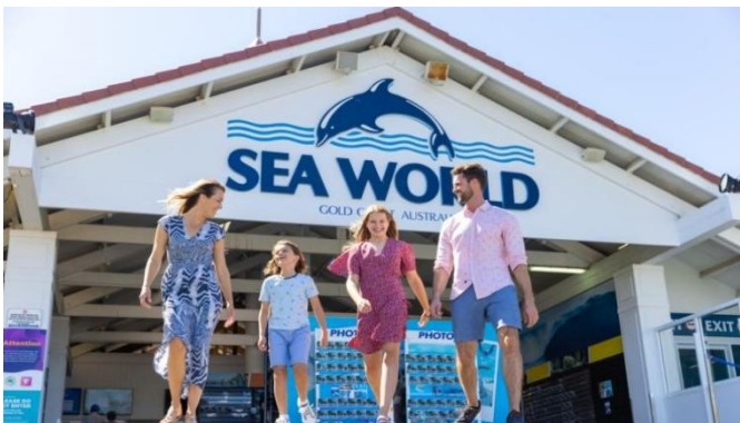
Sea World Gold Coast

早餐后，自由活动。你可以选择自费参加雷明顿国家公园欧莱利雨林+葡萄酒庄之旅。你也可以翻转黄金海岸其他有名的主题乐园如电影世界，狂野水世界，梦幻世界，激流世界等高人气的主题乐园，以您的步伐解锁更多深度体验玩法！