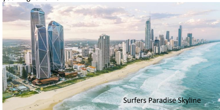
Surfers Paradise Skyline

This morning, after breakfast, if time permits, you can do some last-minute shopping before your transfer to the airport for your flight home.