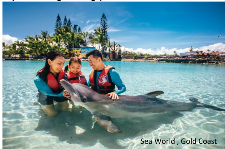
Sea World , Gold Coast

** For 6D4N departures , group depart to Brisbane airport on day 6 for the flight to Singapore.