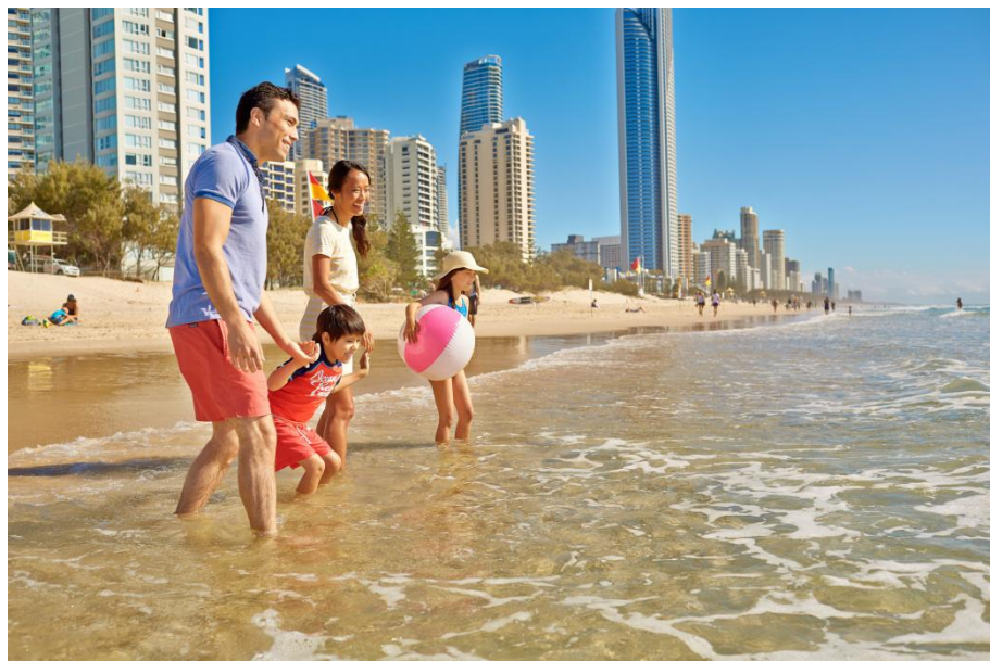
Surfers Paradise, Gold Coast

Upon arrival in Brisbane , feast the five senses upon the most spectacular and breathtaking places in Brisbane. Embark on the city tour visiting to King George Square, City Hall, Chinatown, Treasury Building, Southbank, Parkland . etc. The tour takes you through Brisbane's most famous sights and heritage buildings while connecting you with the city through unusual tales, stories and curiosities. Next, we will head to Gold Coast to kick start the exciting adrenaline-rush journey. Discover the Gold Coast Best Views at Skypoint . Ascend to the highest point in Gold Coast that offers you a stunning 360' views of this spectacular coastal city