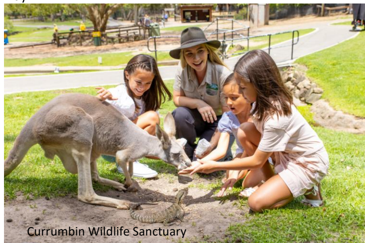
Currumbin Wildlife Sanctuary

Head to Paradise Country Farm for an authentic Australian farm experience. Discover Australia's unique wildlife, gorgeous farm animals and amazing Australian shows with animal encounters and shows for you to enjoy. you can feed the friendly kangaroos, have your photo taken with a cuddly koala, see the skills of the master shearers or watch the stockmen and their dogs round up a flock of sheep, throw a boomerang and crack a stockman's whip. Enjoy your BBQ lunch here while experiencing the traditional Australian bush culture. After lunch, Head to Superbee Honeyworld ,serves as the home of live bee shows, delicious bee hive products, and a large range of honey to choose from. there is a wide array of honey in different flavours that you can check out and taste for free. Just across the road, there is Currumbin Wildlife Sanctuary , Immerse yourself into the wonder and natural beauty of 27 hectares of Currumbin rainforest, wandering through open animal enclosures, feeding kangaroos and cuddling koalas along the way.