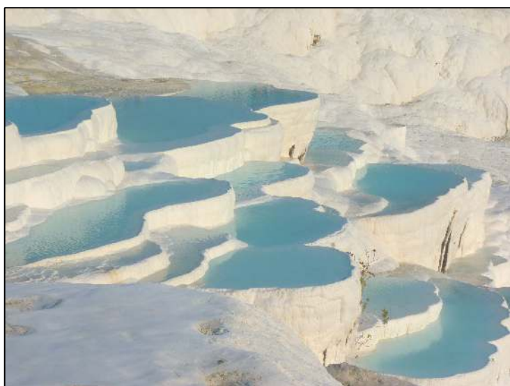
Pamukkale (The Cotton Castle)

After breakfast at the hotel, visit the ancient roman city of Pergamon, famous for the steepest theatre in Turkey, Trajan Temple, Atena Temple, Agora and Pergamon Palace. Thereafter, drive to the ancient city of Troy and the infamous tourist attraction in Troy, of course, is the Trojan Horse. This is a replica wooden horse that was given to the Trojans by the Greek Army.