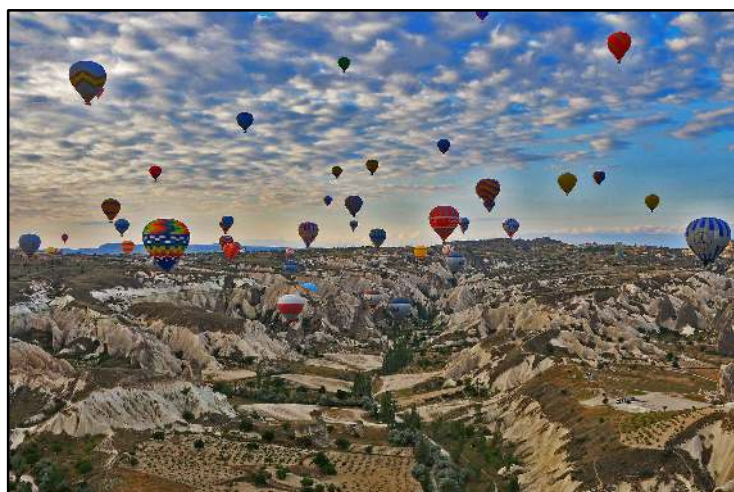
Hot Air Balloons over Cappadocia

include the magnificent Ataturk Mausoleum and visit Anatolian Civilization Museum. Thereafter, drive to Cappadocia for your overnight stay.