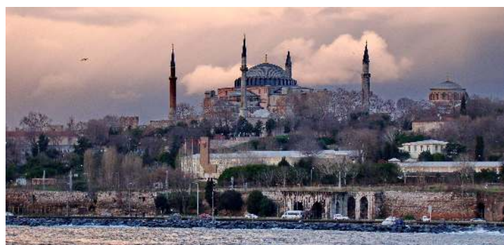
Istanbul Bosphorus Strait

Arrive in Singapore Changi Airport. We hope that you have enjoyed your trip with Super Travels.