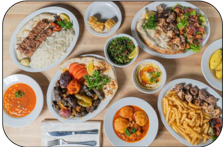
Turkish Cuisine Platter